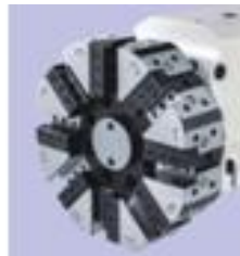
Pragati 8-station turret (optional)