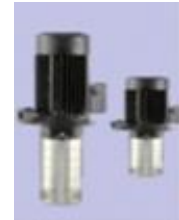
YUNHAI Coolant Pump