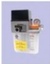
HURUN Lubrication Pump