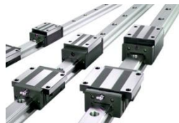
PMI Linear Guideway