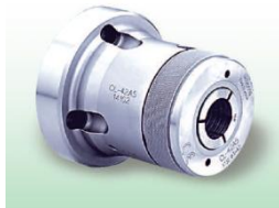
Autogrip Hydraulic Chuck