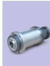
NSK Bearings Spindle Unit (optional)