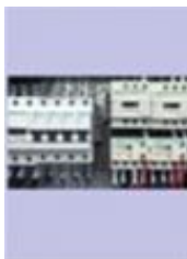
Schneider Electrical Component