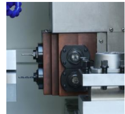
Live tooling on Y axis (optional)